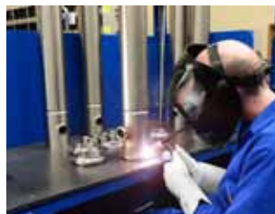
Steel & stainless steel machining and fabrication