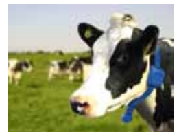
Heat Detection Systems