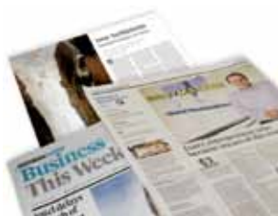
Sales and marketing

For more information please visit www.dairymaster.com