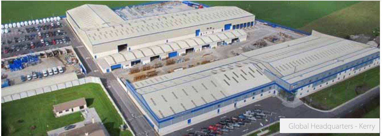
Global Headquarters - Kerry

Dairymaster operates from its head office in Causeway, County Kerry, Ireland.