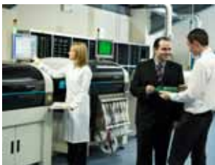
Electronic design & manufacturing